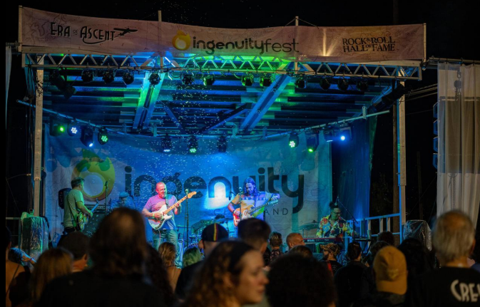
Hello 3D performance on the Lakeview Stage, sponsored by the Rock & Roll Hall of Fame