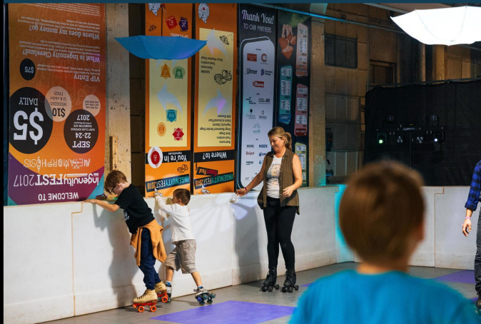
Roller skating by Rollin' Buckeye Foundation