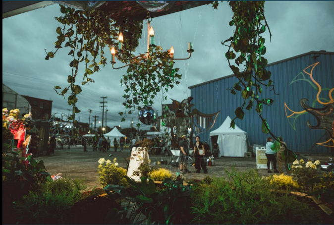
Mechanique Biotique at IngenuityFest 2024