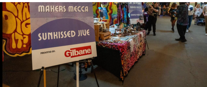
Makers Mecca sponsored by Gilbane