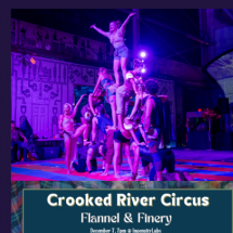
Crooked River Circus