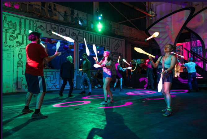
Crooked River Circus.

Did you know that for every single dollar invested by community members and businesses, we earn nearly $7, and invest nearly $10 in the local creative economy?