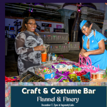
Craft & Costume Bar