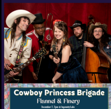
Cowboy Princess Brigade