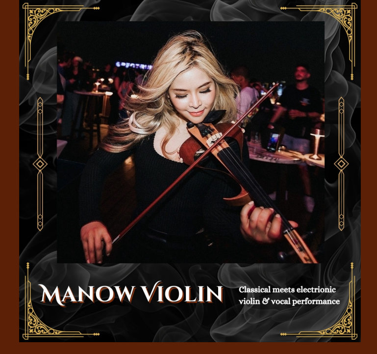
Experience the unique fusion of classical and electronic sounds with <u>Manow Violin</u>, whose captivating violin and vocal performance will leave you spellbound!