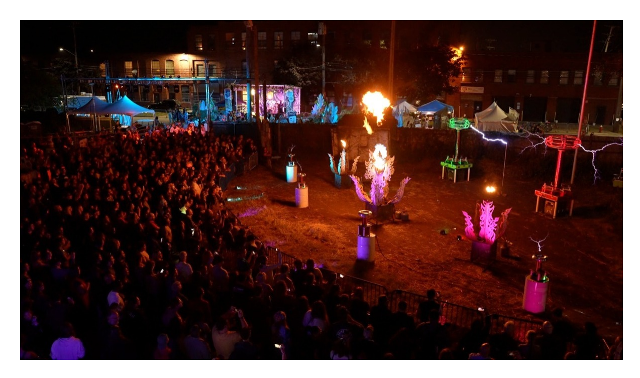
"Fire & Lightning" collaboration between the Tesla Orchestra and Fire Guys LLC