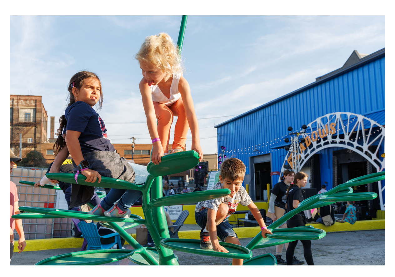
Children play on "Purpureus" by Illuminera Studios at IngenuityFest 2023: Photo by Janet Century