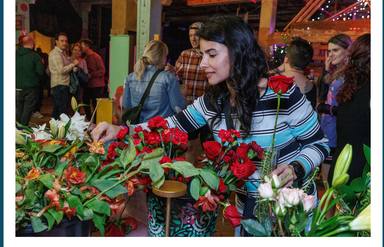
Build a Bouquet by Big Hearted Blooms at IngenuityFest 2023: Photo by Janet Century

I'd like to help ignite the creative spark!