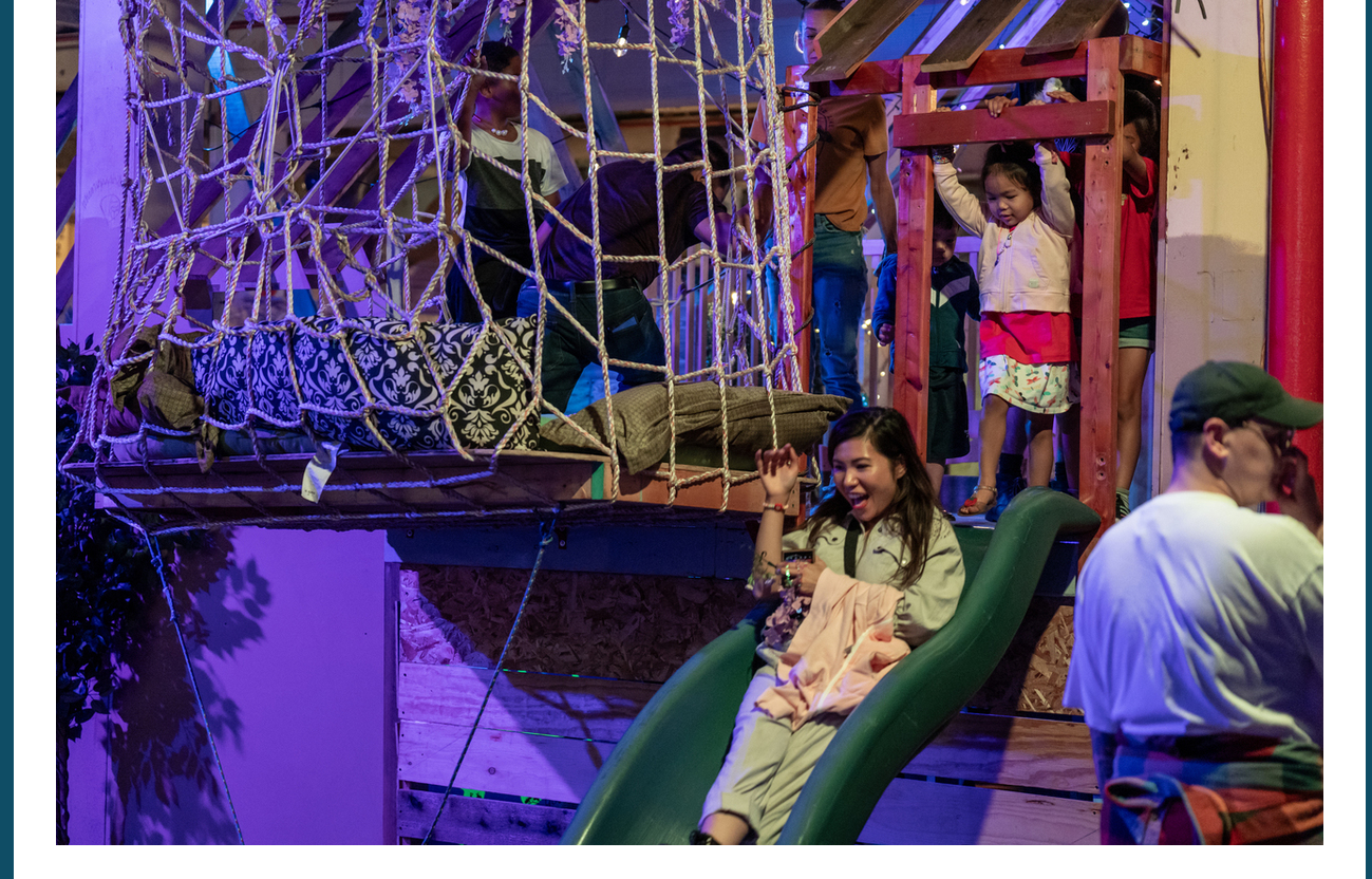
The Treehouse at IngenuityFest 2023

I'd like to help ignite the creative spark!