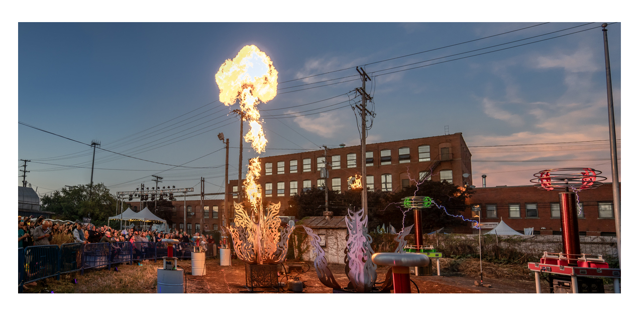
"Fire & Lightning" collaboration between the Tesla Orchestra and Fire Guys LLC