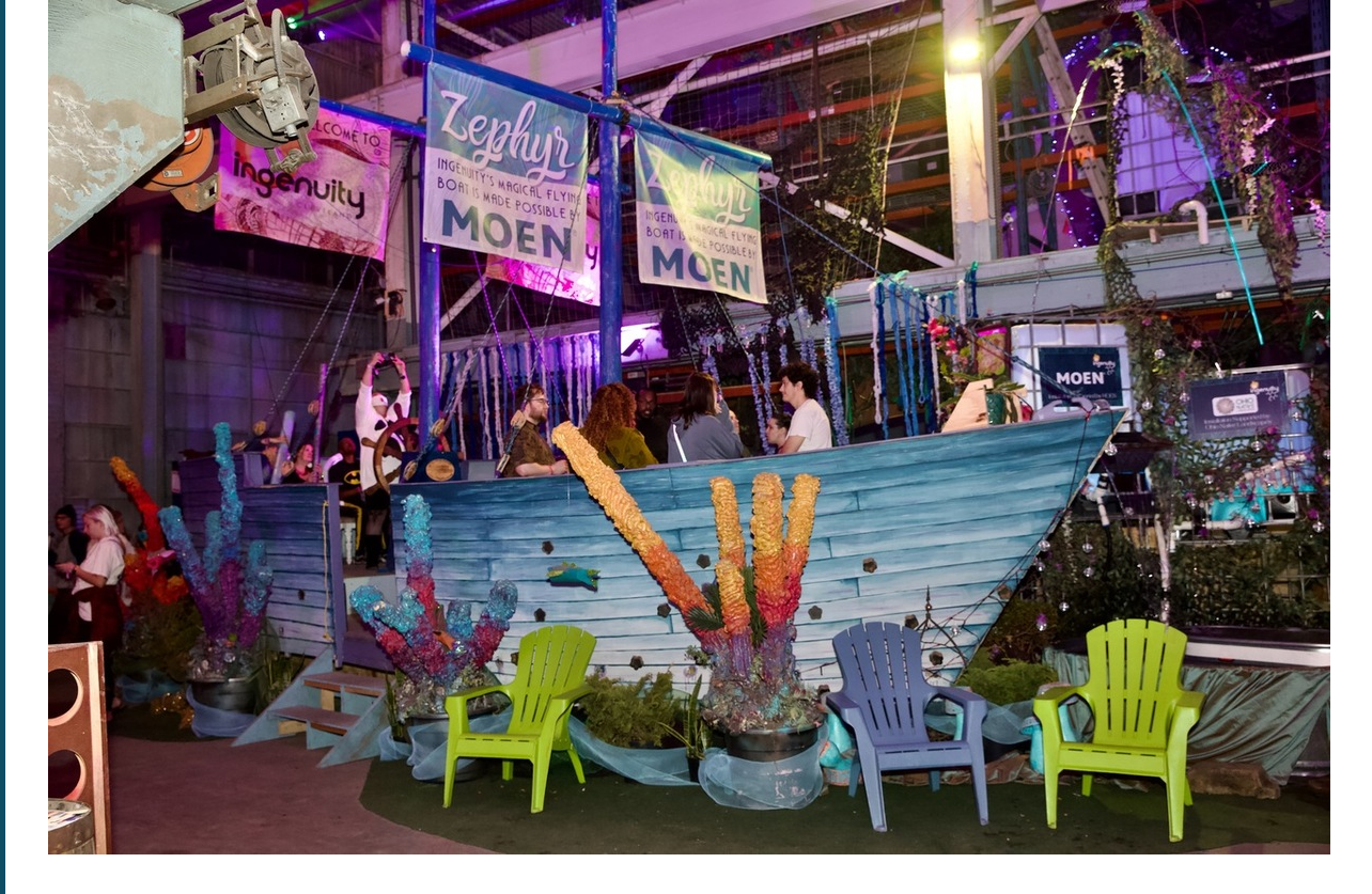
"Zephyr", the Magical Flying Boat, Presented by Moen at IngenuityFest 2023: Photo by Cynthia Penter